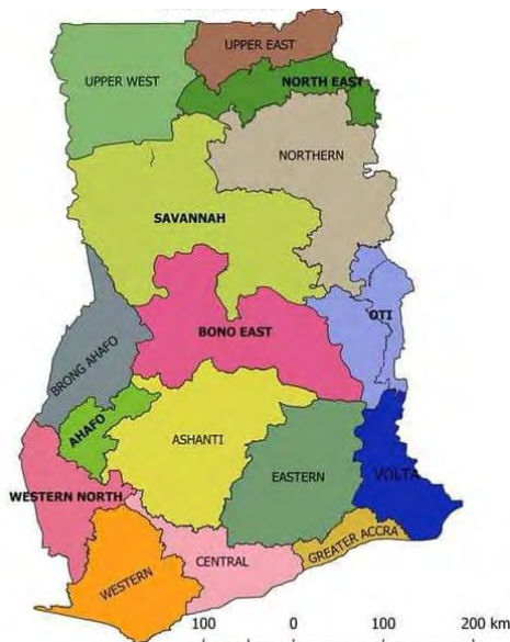
Map of Ghana and its regions

Ghana is located along the Gulf of Guinea in the sub-region of West Africa and is bordered by the Ivory Coast in the west, Burkina Faso in the north, and Togo in the east. Ghana has a population of over 28 million, 1 with more than half of the country aged under 25 years. 2 The official language of Ghana is English, and its capital city is Accra, in the south.