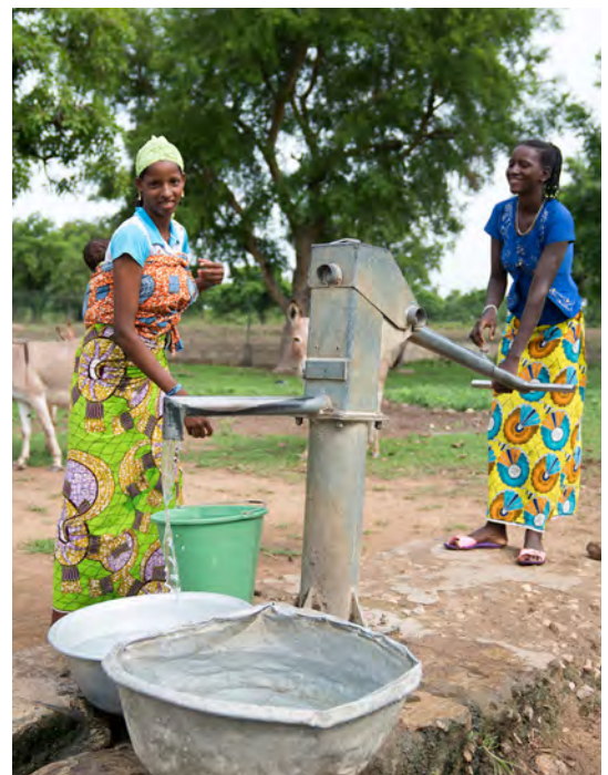
Women draw clean water from a borehole

Ghana is a predominantly Christian country (71.2% of the population in 2010), with a sizeable Muslim population (17.6%) and a smaller number of Traditionalists (5.2%) and non-religious (5.2%). The remaining 0.8% of the population identify as 'Other'. 14 In the Northern Region the dominant religion is Islam (60% of the population), with Christianity being the next largest religion (21%). 15 In the Upper East Region, Traditionalism is predominant (46%), followed by Christianity (28.3%) and Islam (22.6%), 16 while in the Upper West Region the largest religion group is Christianity (35.5%), closely followed by Islam (32.2%) and then Traditionalism (29.3%). 17