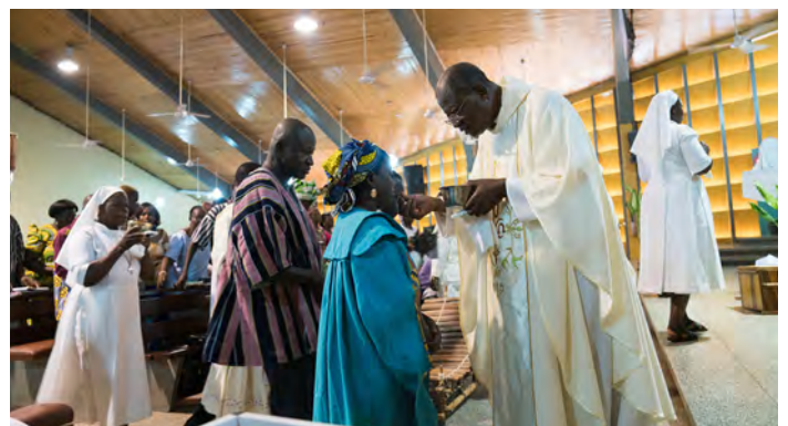
Mass at the Cathedral in Tamale