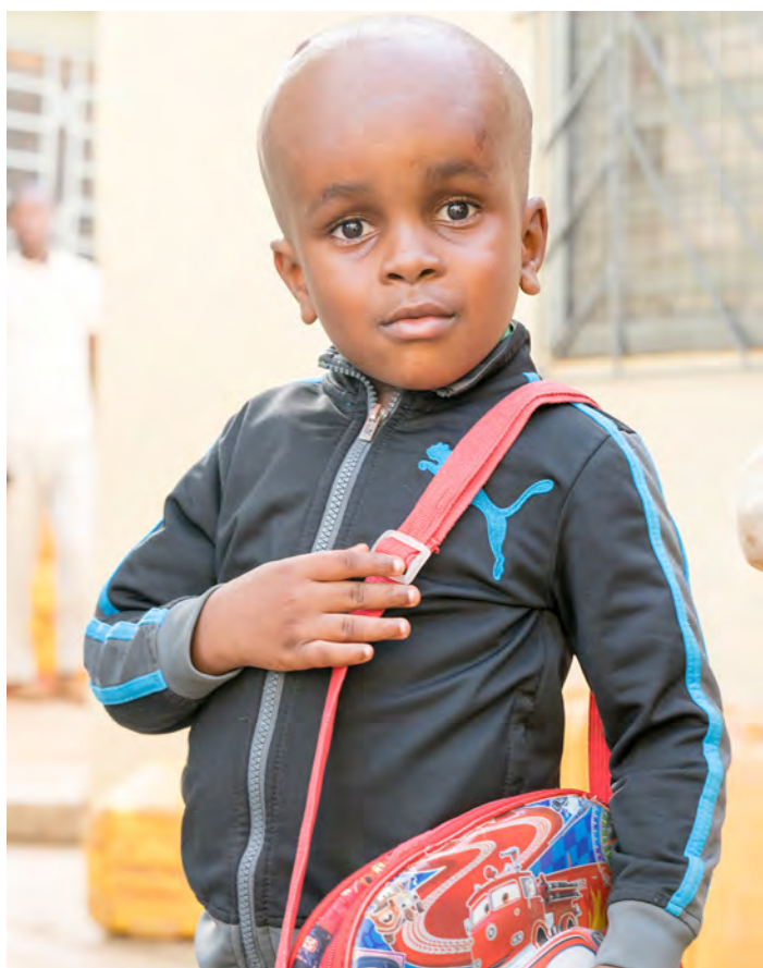
Clockwise from top left: Schoolchildren in northern Ghana; a teacher marking papers; and teachers in training in Yendi