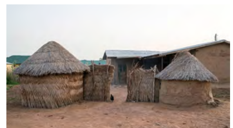
Traditional huts in Ghana's Northern Region

The north of Ghana experiences significant dry periods due to its proximity to the Sahara Desert. 8 The harsh climate contributes to adverse economic conditions in the region, where the main economic activity is agriculture. 9 In comparison, southern Ghana experiences a higher level of economic development, and there is a corresponding trend of migration from the north to the south of Ghana where people seek better economic outcomes and access to services. 10 This in turn contributes to underdevelopment in the north, reinforcing the cycle of poverty. 11